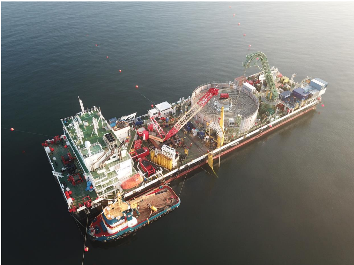
CABLE LAYING VESSEL